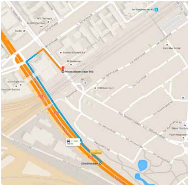
Coming from the Utrechtsebaan (A12)

Coming from the N44/A44 from the direction of Voorburg, Wassenaar, Leiden and Amsterdam turn left in the direction of Voorburg/Leidschendam. You will come onto the Laan van Nieuw Oost Indië. Turn right onto the Schenkkade. At the second crossing with traffic lights, turn left onto the Prinses Beatrixlaan. The entrance of the parking is situated on your right, just before the viaduct.